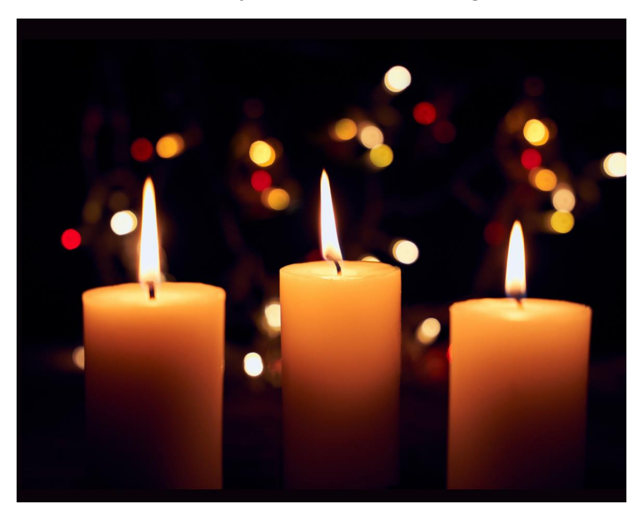
St. Paul's Episcopal Cathedral

For all victims of violence, and particularly for the victims of recent mass shootings