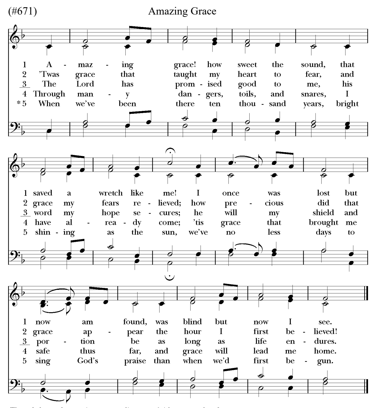
The melody may be sung in canon at distances of either two or three beats.

After Communion, the Celebrant says Let us pray.